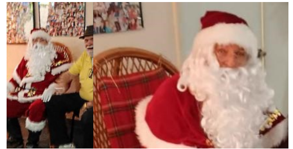
SEE MORE PICTURES FROM THE CHILDREN'S CHRISTMAS PARTY