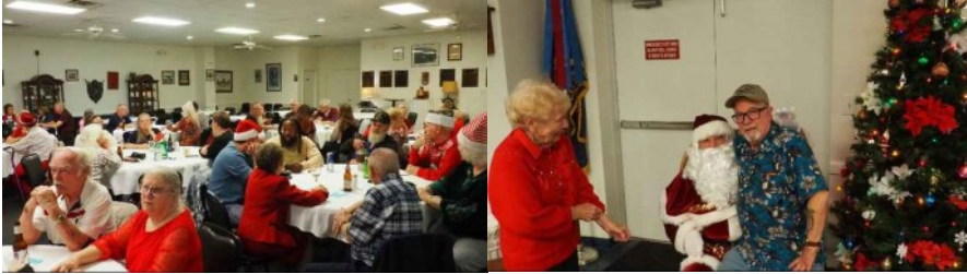
SEE MORE PICTURES FROM THE BRANCH 269 CHRISTMAS PARTY