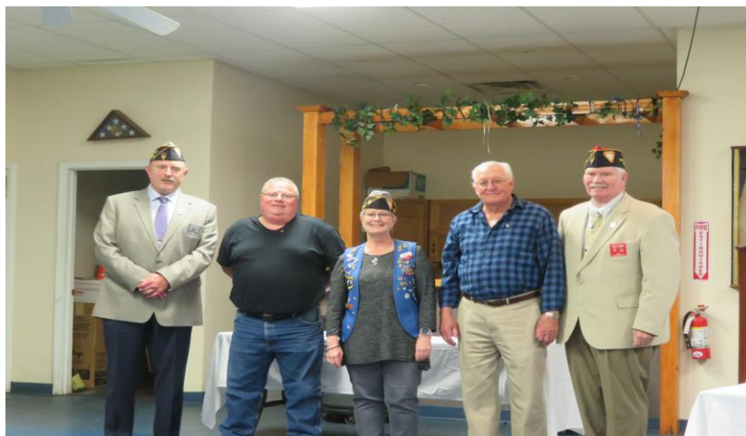
FRA President (right) awarded continuous membership pins to: