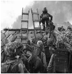
Left: Amphibious Landing in Inchon, Korea Sept 15, 1950

The Home will have an indoor picnic beginning at 1200 noon