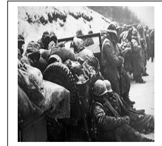
Right: Marines fight in Chosin Reservoir Nov 26- Dec 11, 1950

Officially, the Korean War never technically ended . Although the Korean Armistice Agreement brought an end to the hostilities that killed 2.5 million people on July 27, 1953, that ceasefire never gave way to a peace treaty. At the time, South Korea's president refused to accept the division of Korea.