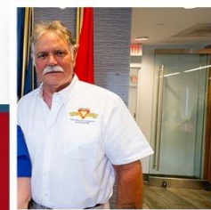
Centennial Button Down White MEN:#1009 WOMEN:#10011 CENTENNIAL BUTTON-DOWN SHIRT (MENS AND WOMENS STYLES) – Two colors – white and blue. 55% cotton/45% polyester.