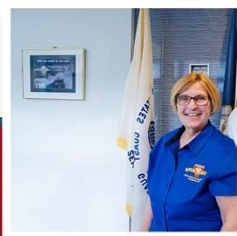
Centennial Button Down Blue MEN: #10010 WOMEN:#10012 CENTENNIAL BUTTON-DOWN SHIRT (MENS AND WOMENS STYLES) – Two colors – white and blue. 55% cotton/45% polyester.