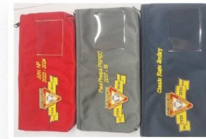
#1004 CENTENNIAL HAT BAGS – Three colors – blue for Shipmates, for National Officers or past National Officers (i.e. you have a "grey hat") and red for National President or past National President. The hat bag can be personalized for an added fee.